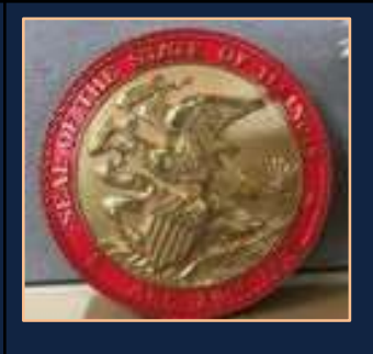
Dark Blue | PMS 280